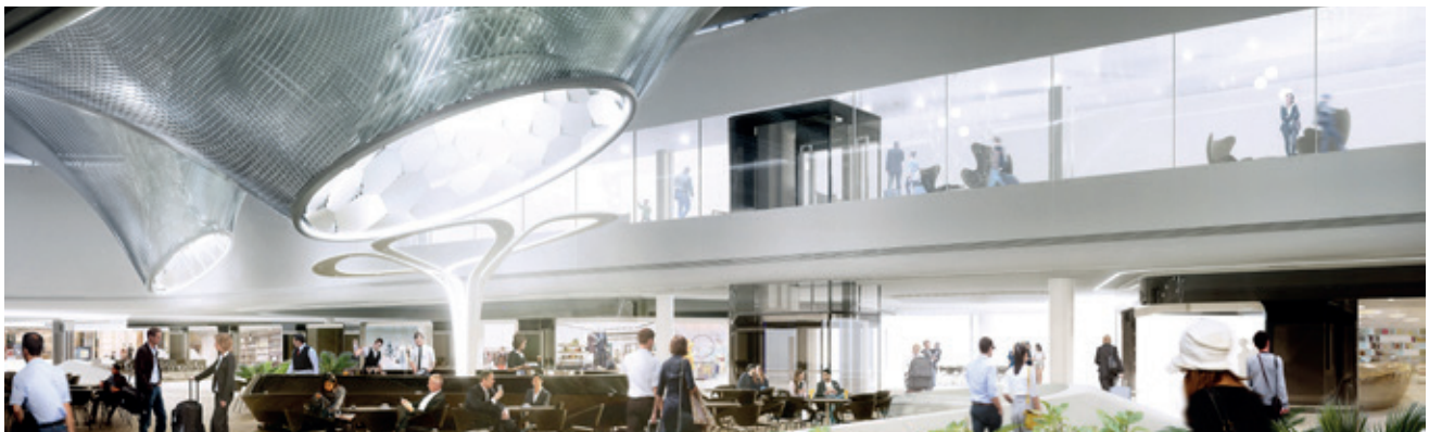
This is what the commercial area of the new Terminal 3 at Frankfurt Airport is going to look like. The building automation will be designed using the electrical CAD solution from WSCAD.

on to the external BA designers, so that they all have the same base to work from. The goal is to quickly ensure compliance with the required standards and a higher quality. "We still have a lot to do", says Eckardt, "but thanks to WSCAD we are in time and on a good path."