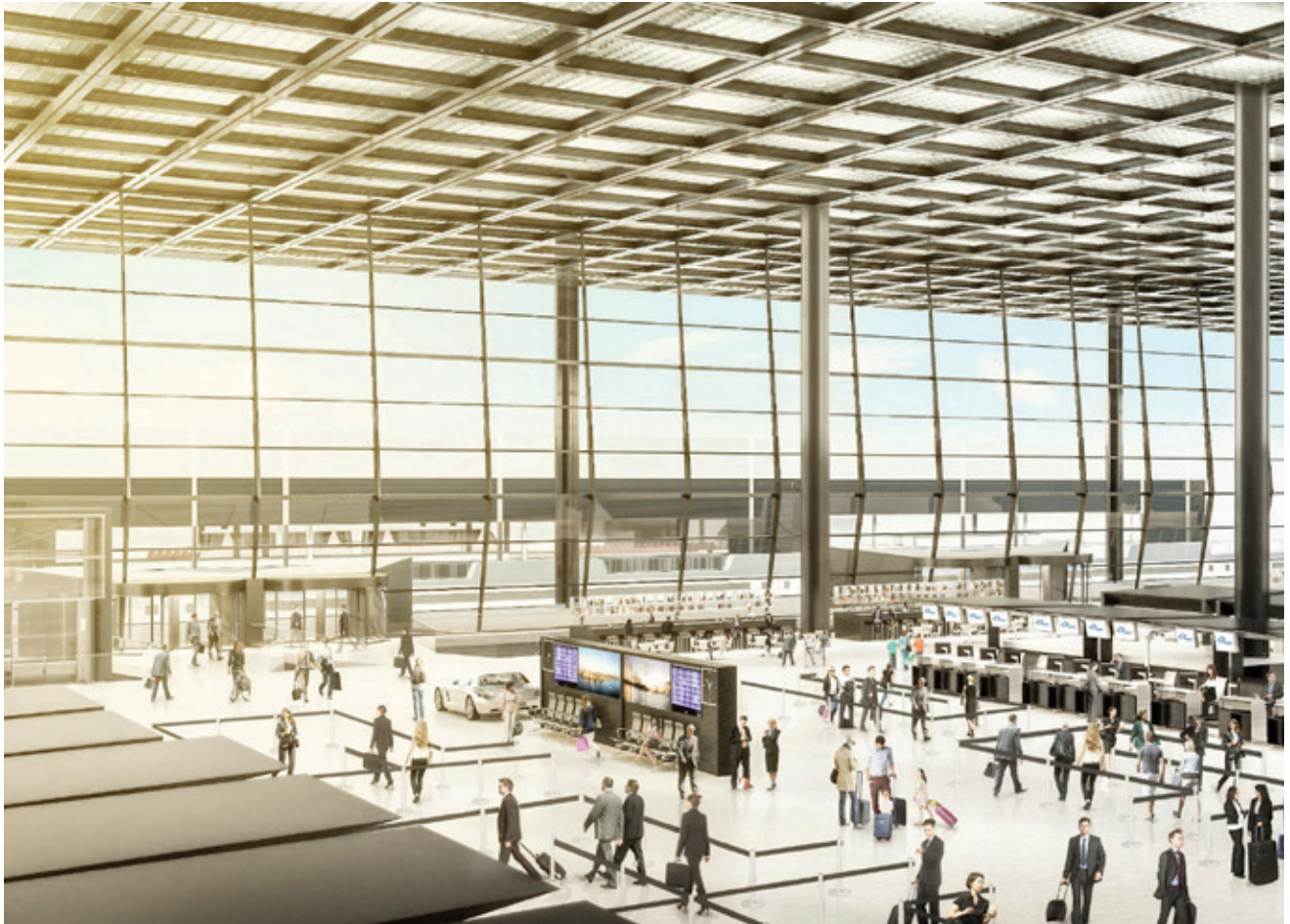
The design of the building and room automation for the check-in hall in the new Terminal 3 at Frankfurt Airport is done with the electrical CAD solution from WSCAD.

WSCAD is part of the Buhl group with more than 800 employees. WSCAD has been developing electrical CAD solutions for three decades. Customers include medium-sized companies, international corporations and engineering service providers. More than 35,000 users rely on WSCAD software as their electrical CAD solution. The software is based on one core platform that covers six engineering disciplines: Electrical Engineering, Cabinet Engineering, Piping and Instrumentation, Fluid Engineering, Building Automation and Electrical Installation. Any change made to a component in one discipline immediately reflects in all the other disciplines. WSCAD methodologies for standardization, reuse and automation significantly reduce engineering time from several weeks to just a few hours or even minutes. At the same time, these practices also ensure a much higher quality of work.