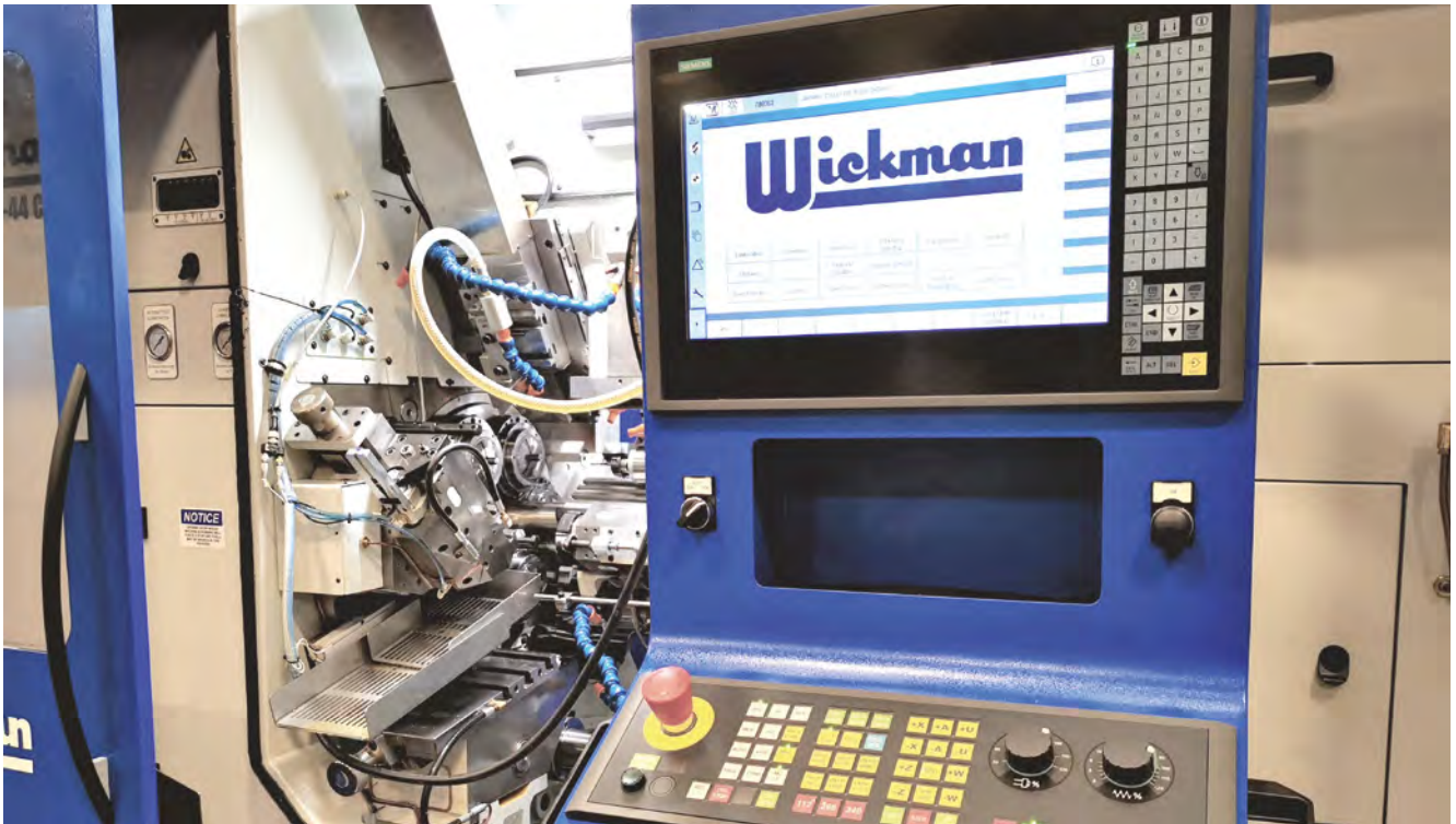
Wickman's designers are among 35,000 users worldwide who have chosen the WSCAD SUITE as their preferred CAD solution to speed up electrical engineering tasks within the design and production process of extremely precise, high quality machines.

stallation is also highly valued. This allows any changes made to a component in one discipline to be reflected and completed immediately in all the other disciplines. Not only do these features reduce engineering time from several weeks to just